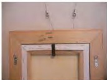
WOOD FRAME with D-RINGS

Display Requirements: All work must arrive at the gallery by Aug. 12 with a label on back, ready to install. Accepted work that differs significantly from the entry images will be disqualified. Gallery wrapped Canvas is preferred as long as your edges are finished or clean. Gallery walls have wires & hooks that hook into the D-Rings or Screw eyes on the back of your work. All work MUST have 2 D-rings or screw eyes attached on the back, one on either side (usually no further than 1 1/2 inches from the top of the piece - use your judgment considering the weight of your work so that the top of you work will not hang far from the wall ). Screw eyes or rings must have at least ¼ inch opening for our hooks to fit in. The Mills Pond Gallery is in an historic building. We have plaster walls –absolutely no nails, screws, etc. are allowed on walls to display work. We do not use wire to hang work.