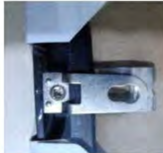
Metal Frame w/adjustable D-Ring