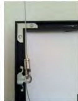
Metal Frame with Sliding D-Ring

Shipping: Artists are responsible for shipping to and from the gallery. The Mills Pond Gallery assumes no liability for damages to your work during shipping or while in our possession. Work will be inspected upon arrival and you will be contacted about shipping damage. Boxes arriving with exterior damage will be photographed for you in the event you wish to pursue damage reimbursement with your shipper. You may use the shipping company of your choice as long as they deliver directly to the gallery. Please notify them of our weekday delivery/ pickup hours (10 am – 4 pm Wed - Fri). We will not pick up or drop off work at UPS, Post Office or any other drop site. Shipping Address Mills Pond Gallery, 660 Route 25A, St. James, NY 11780. If you use FedEx, please consider FedEx Home or Express. We have experienced many damages with FedEx Ground shipments.