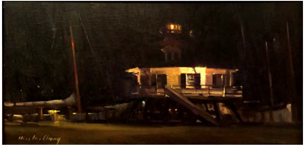
Hiu Lai Chong - All Tucked In