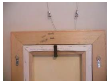
Metal Frame with Sliding D-Ring

Sale of Artwork: All work, unless indicated as not for sale (NFS), will be available for sale during exhibit. The gallery encourages sales and retains a 30% commission on all work sold. Artists set the sale price on the entry form.