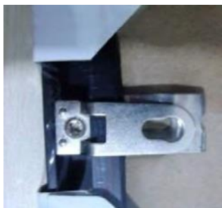
Screw Eye and D-Ring