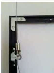
Metal Frame w/adjustable D-Ring