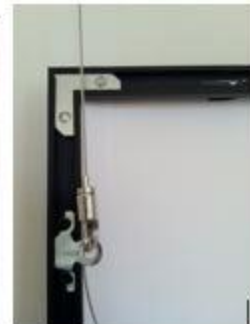
Metal Frame with Sliding D-Ring

Shipping: Artists are responsible for shipping to and from the gallery. The Mills Pond Gallery assumes no liability for damages to your work during shipping or while in our possession. Work will be inspected upon arrival and you will be contacted about shipping damage. Boxes arriving with exterior damage will be photographed for you in the event you wish to pursue damage reimbursement with your shipper. You may use the shipping company of your choice as long as they deliver directly to the gallery. Please notify them of our weekday delivery/ pickup hours (10 am – 4 pm Wed - Fri). We will not pick up or drop off work at UPS, Post Office or any other drop site. Shipping Address Mills Pond Gallery, 660 Route 25A, St. James, NY 11780. If you use FedEx, please consider FedEx Home or Express. We have experienced many damages with FedEx Ground shipments.