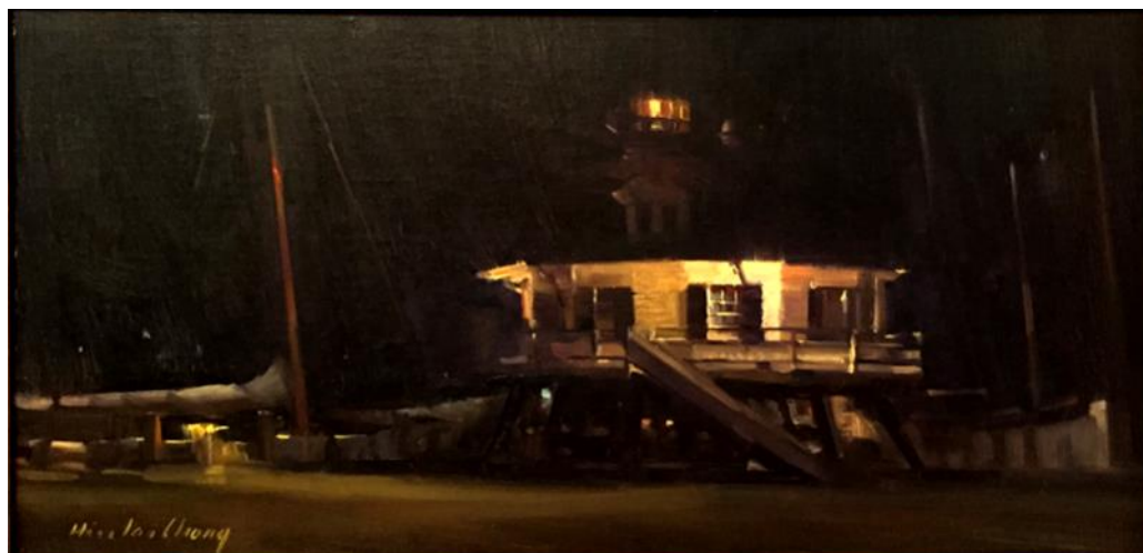
Hiu Lai Chong - All Tucked In