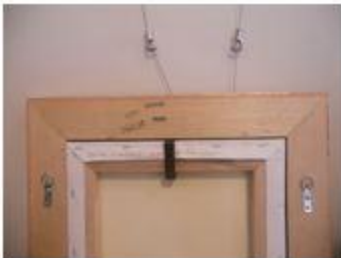
WOOD FRAME with D-RINGS

Display Requirements: All work must arrive at the gallery by Aug. 12 with a label on back, ready to install. Accepted work that differs significantly from the entry images will be disqualified. Gallery wrapped Canvas is preferred as long as your edges are finished or clean. Gallery walls have wires & hooks that hook into the D-Rings or Screw eyes on the back of your work. All work MUST have 2 D-rings or screw eyes attached on the back, one on either side (usually no further than 1 1/2 inches from the top of the piece - use your judgment considering the weight of your work so that the top of you work will not hang far from the wall ). Screw eyes or rings must have at least ¼ inch opening for our hooks to fit in. The Mills Pond Gallery is in an historic building. We have plaster walls –absolutely no nails, screws, etc. are allowed on walls to display work. We do not use wire to hang work.