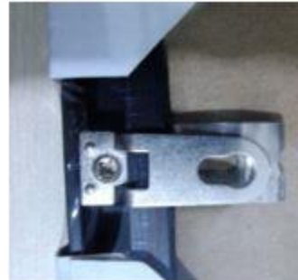
Metal Frame w/adjustable D-Ring